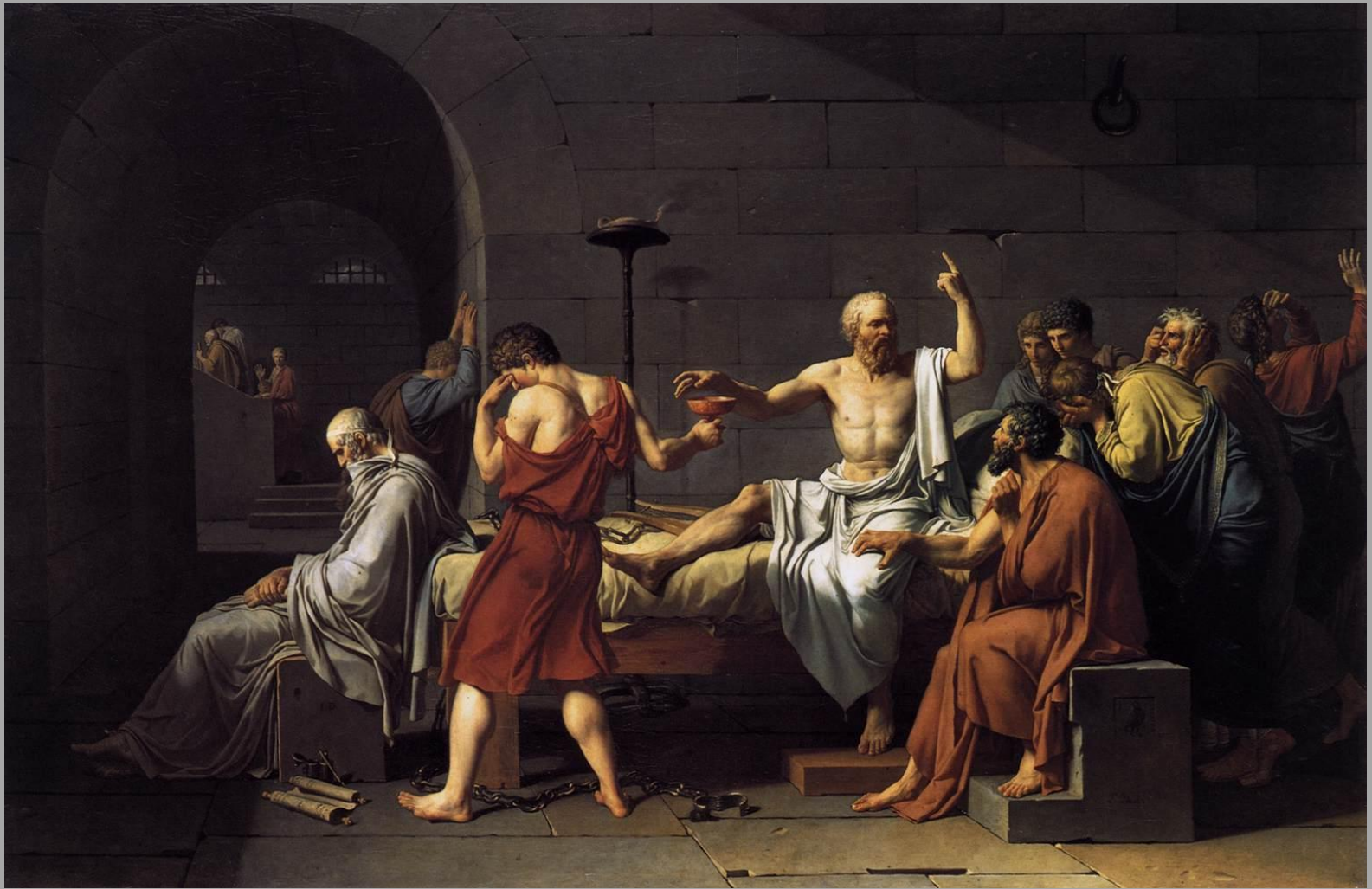
The Death of Socrates